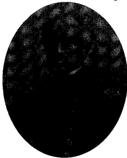
Col. Ethan Allen Hitchcock

Ordering troops to the Rio Grande, into territory inhabited by Mexicans, was clearly a provocation. Taylor's army marched in parallel columns across the open prairie, scouts far ahead and on the flanks, a train of supplies following. Then, along a narrow road, through a belt of thick chaparral, they arrived, March 28, 1846, in cultivated fields and thatched-roof huts hurriedly abandoned by the Mexican occupants, who had fled across the river to the city of Matamoros. Taylor set up camp, began construction of